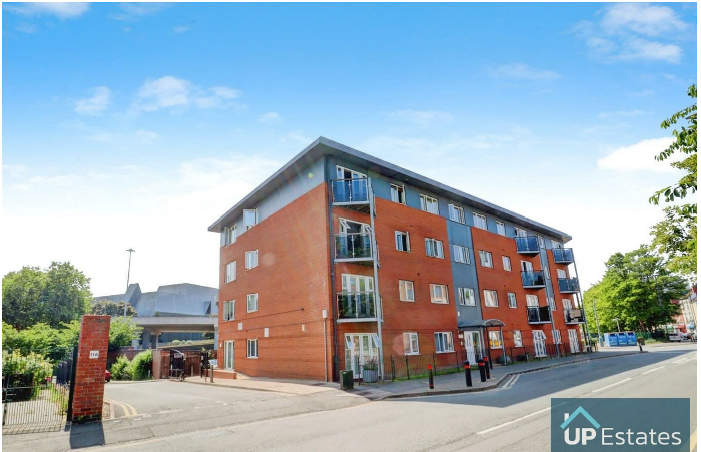
Bodiam Hall, Lower Ford Street, Coventry